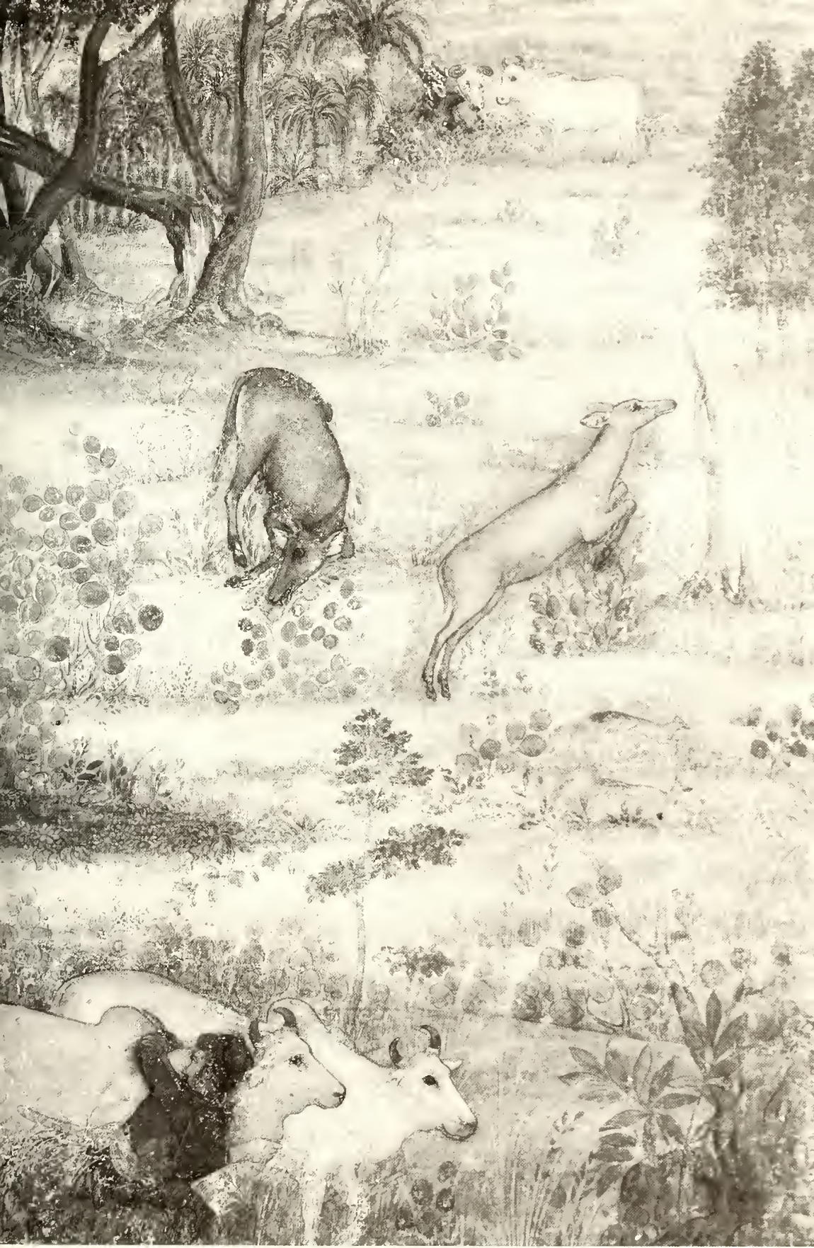
Figure 5. Attributed to Payag, Dara-Shikoh Hunting Nilgais . India, Mughal dynasty, ca. 1640. Opaque watercolor on paper, 15.8 x 22.1. Arthur M. Sackler Gallery, Smithsonian Institution, S1993.42a