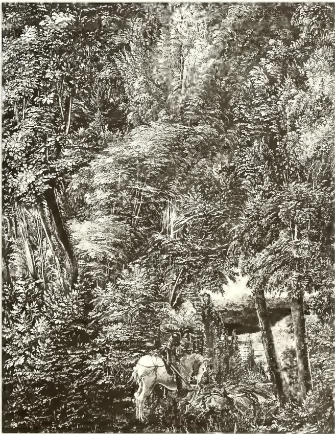
Figure 22. Albrecht Altdorfer (ca. 1480–1538), Forest with St. George and the Dragon , 1510. Oil on parchment attached to a limewood panel, 28.2 x 22.5. Alte Pinakothek, Munich, waf 29