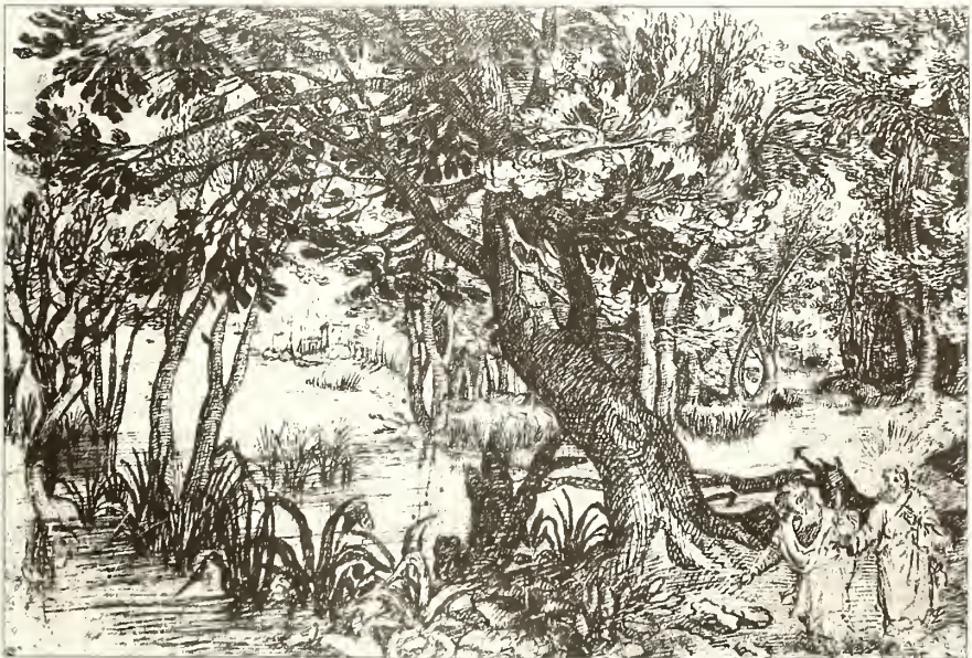
Figure 20. Attributed to Gillis van Coninxloo (1544–1607). Woodscape with Temptation of Christ , 1586. Pen on paper, 19 x 28. Historische Musea—Stedelijk Prentenkabinet, Antwerp (After H. G. Franz, Niederländische Landschaftsmalerei im Zeitalter des Manierismus , Graz, 1969)

A painterly mode of free, open brushwork with no precedent in Islamic or Indian art had already appeared in the formation period of Mughal painting, in particular in several illustrations of the Cleveland