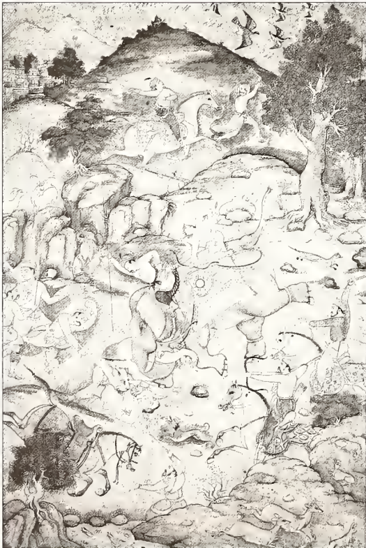
Figure 4. Jahangir Hunting a Lion. India, Mughal dynasty, early 17th century. Watercolor, ink, and gold on paper, 26.2 x 16.8.