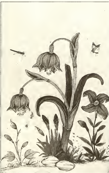
Figure 16. Attributed to Muhammad Khan, Flower Study with Tulips and Insects . India, Mughal dynasty, ca. 1630–35, from the Dārā Shikōh Album , assembled ca. 1633–42. Opaque watercolor on paper, 16.7 x 10.6. British Library, Oriental and India Office Collections, London, Add. Or. 3129, fol. 65b

However, nothing in these elegant and rather cool depictions of plants and birds—which had only further refined an already stylized tradition of nature studies in Mughal miniature painting (fig. 16)—prepares one for the revolutionary naturalism of the landscape of Dara-