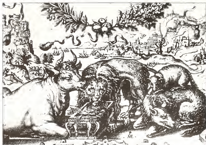
Figure 23. Don Luis Manrique and Pieter van der Borcht, engraving by Pieter van der Heyden, Pietatis Concordiae (Union through Piety), first title page (1569) of vol. 1 of the Royal Polyglot Bible (Antwerp: Christophe Plantin, 1568–72), detail with harbor landscape in the background. Österreichische Nationalbibliothek, Vienna