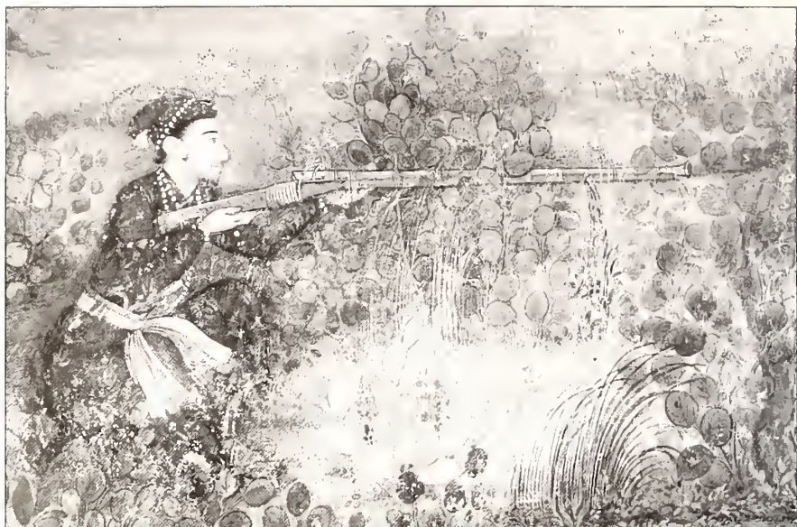
Figure 9. Detail, fig. 5, Dara-Shikoh firing a bullet from his matchlock gun.