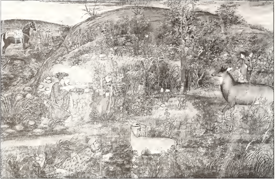
Figure 6. Attributed to Payag, Shah-Shuja' Hunting Nilgais . India, Mughal dynasty, ca. 1655. Opaque watercolor on paper, 16.8 x 26. Museum of Art, Rhode Island School of Design, Providence, Museum Works of Art Fund, 58.068

camouflage while positioning himself with his matchlock gun, the barrel of which rests on a fork (fig. 9). (The pose of the prince can be better understood when compared with figure 10, a drawing in the Chester Beatty Library, datable to the 1620s, showing his father, Shah-Jahan, in a similar position taking aim with his matchlock). 39 Dara-Shikoh has just fired a shot at the nilgai bull. Hit in the shoulder, the bull drops mortally wounded, while his tan-colored female bounds to escape.