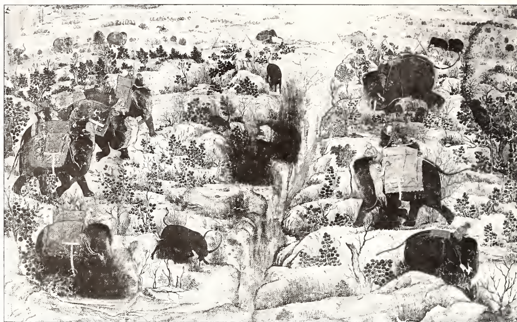
Figure 19. Attributed to Payag, Shah-Jahan and His Sons Hunting Lions . India, Mughal dynasty, late 1650s. Opaque watercolor on paper, 25.5 x 41.7. Keir Collection, London

angle of almost ninety degrees deep into the background, 77 becomes the main subject and ordering force of the composition. Branching off from the perpendicular nullah—like ribs of the spinal column—are the same parallel horizontals used to structure the landscape of Dara-Shikoh's hunt. They allow the artist to integrate without effort the imperial hunters on their elephants in hierarchically correct side views into the spacious, illusionistic landscape, seen almost in bird's-eye view from above. Although the nullah is placed off center, the composition is clearly conceived under the influence of that favorite ordering principle of Shah-Jahani art, qarīna , or correspondence, a symmetrical arrangement of features on both sides of an axis with emphasis on the central feature. 78 The structure of the landscape is fleshed out with a similar, though more restrained, naturalistic treatment of surface and texture as the Dara-Shikoh hunt and enlivened by freely painted anecdotal detail in thin, almost monochrome brown brush lines. One notices in particular (above the large buffalo on the left side of the nullah) a hunter being knocked down by a lion, a common motif of Mughal hunting scenes made popular by a famous imperial hunting episode in 1610. 79