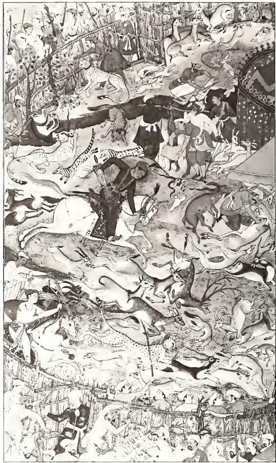
Figure 3. Miskina ( tarh ) and Mansur ( amal ), Akbar Holds a Qamargah Hunt near Lahore in March 1567, from the Akbarnāma . India, Mughal dynasty, 1590s. Opaque watercolor on paper, 32.1 x 18.8. Victoria and Albert Museum, London, I.S. 2-1896 56/117