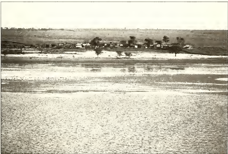
Figure 29. The lake at Bari seen from Shah-Jahan's hunting palace, 1993