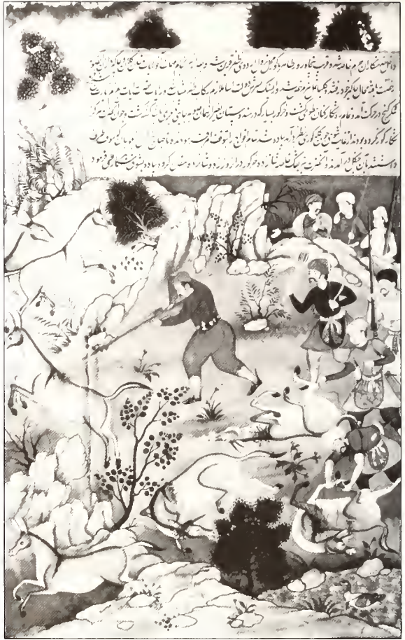
Figure 17. Akbar Hunting Wild Ass in the Punjab in Late 1570. India, Mughal dynasty, from the Tārīkh-i Khāndān-i Tīmūriyya , ca. 1584–86. Opaque watercolor on paper. Khuda Bakhsh Library, Patna, acc. no. 107