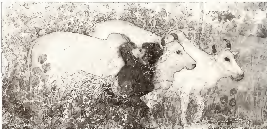
Figure 11. Detail, fig. 5, huntsman taking cover behind a pair of decoy bullocks.