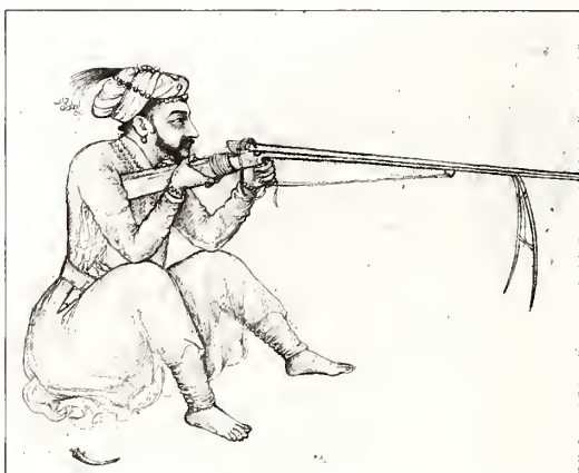
Figure 10. Shah-Jahan Taking Aim . India, Mughal dynasty, ca. 1620s. Brush drawing on paper, 10.2 x 11. Chester Beatty Library, Dublin, 11A.4