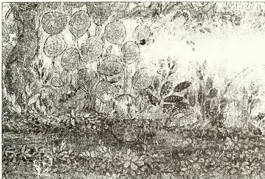
Figure 14. Detail, fig. 5, rabbits hiding on the right side below the bush in the center of Dara-Shikoh Hunting Nilgais .

Already the Mānasollāsa suggested that for the hunt with decoy animals the huntsmen should be dressed fully in green, with weapons of green color. 47 Abu'l Fazl also mentions this aspect of the shikār-i ābhū bā ābhū but more as a curiosity, 48 because for the qamargāh hunt such camouflage was not necessary. The growing interest in the shikār-i ābhū bā ābhū eventually prompted the Mughal court to adopt green robes for all forms of hunting, with the favorite flower designs of Shah-Jahani court dress. Even the imperial halo was at times depicted in green, as camouflage totale , so to speak. 49