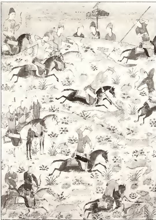
Figure 18. Hunting scene from a Khusraw and Shīrīn by Nizāmī, Iran, Tabriz school, early 15th century. Color and gold on paper, 21.7 x 15.8. Freer Gallery of Art, Smithsonian Institution, F31.33