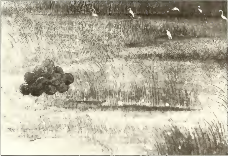
Figure 28. Detail, A Mughal Princess Hunting Game-Birds . India, Mughal dynasty, ca. 1660, from the St. Petersburg Album. Opaque watercolor on paper, 32.4 x 47.6. Purchase—Anonymous donor and the Friends of Asian Arts, Freer Gallery of Art, Smithsonian Institution, F1994.4