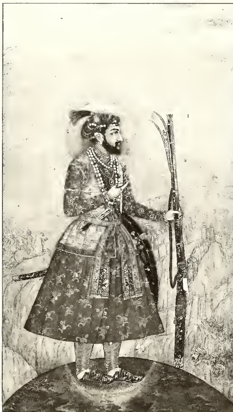
Figure 25. Payag, Shah-Jahan with His Gun . India, Mughal dynasty, ca. 1630–36. Opaque watercolor and gold on paper, 20.4 x 11.5. Chester Beatty Library, Dublin, 7B.28

In Dara-Shikoh Hunting Nilgais these illusionistic background landscapes become the main subject of a painting. The free naturalistic mode of the wooded landscape absorbs and transforms the narrative of the hunt, the hierarchically correct figures, psychological portraiture, and intimately studied nature—all typical concerns of Mughal painting of the period—into a masterly synthesis full of tension and expressive power. But it was to be only a brief moment in Indian painting created by a master artist's ingenious response to the specific interests of his