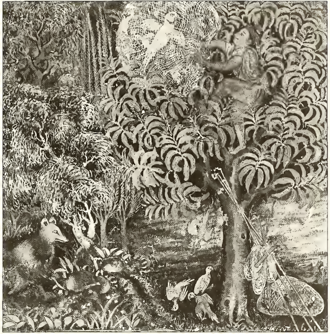
Figure 21. A Fowler Captures the Wise Parrot Who Claimed to Have Unusual Powers to Heal Humans , from the Tūṭīnāma (Tales of a Parrot), fol. 35a. India, Mughal dynasty, ca. 1560. Color and gold on paper, 20.3 x 14. Cleveland Museum of Art, gift of Mrs. A. Dean Perry, 1962.279