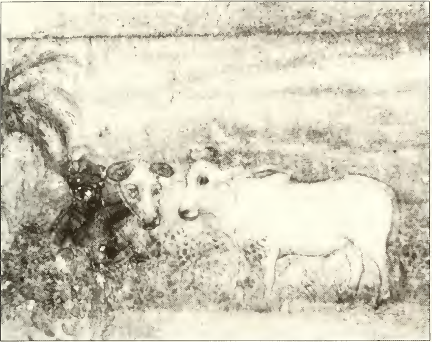
Figure 12. Detail, fig. 5, huntsman taking cover behind a pair of decoy bullocks.