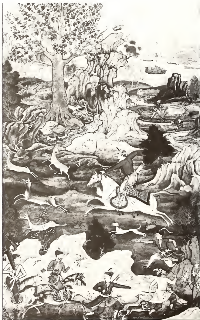
Figure 24. Mukund, Faridun, and the Gazelle , from a Khamsa of Nizāmi. India, Mughal dynasty, 1595. Opaque watercolor on paper, 17.2 x 10.7. British Library, Oriental and India Office Collections, London, Or. 12208, fol. 19a