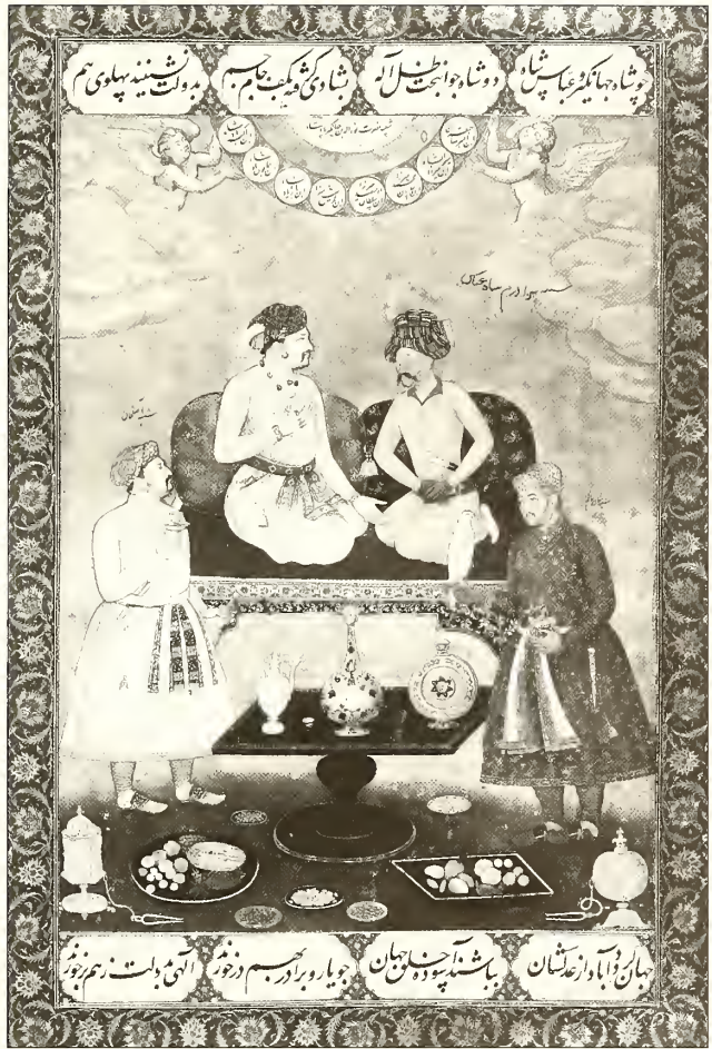
Figure 1. Jahangir Entertains Shah 'Abbas , from the St. Petersburg Album. India, Mughal dynasty, ca. 1618. Opaque watercolor and gold on paper, 25 x 18.3. Freer Gallery of Art, Smithsonian Institution, F42.16